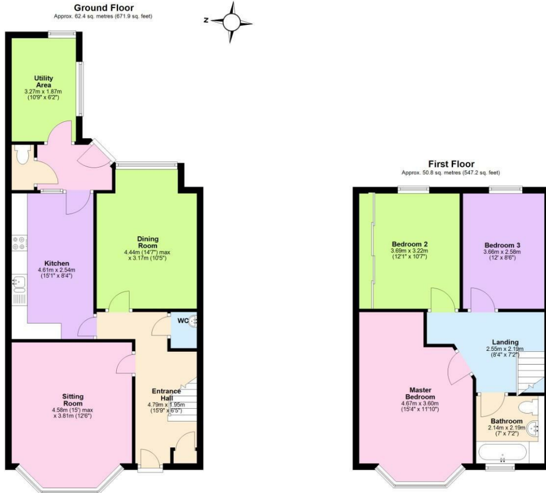
Total area: approx. 113.3 sq. metres (1219.1 sq. feet) 35 Park Rd , Keynsham, Bristol